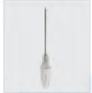
Filter Needles Sterile Pack Needle material: stainless steel Cap material: polyethylene Hub material: polypropylene Connection type: Luer lock