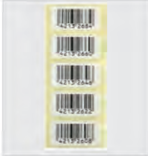
Barcode Labels Sterile Packs Coated wood-free paper 80gsm Acrylic based adhesive