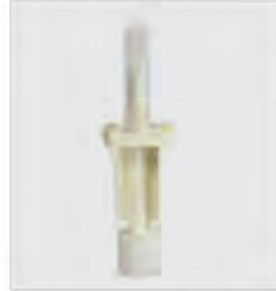
Codan Dispensing Pins Sterile Pack Dispensing pin for safe injection or withdrawal of cytostatic drugs from vials