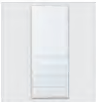
Self Adhesive Labels Sterile Pack White uncoated paper 70 gsm Acrylic based adhesive