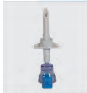
Non-Vented Dispensing Pins Pack Valve material: Bayer makrolon polycarbonate Spike material: Bayer lustran ABS Connection type: Luer lock