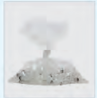
Pharmacy Waste Bag for Sterile Packs - Sterile 100% virgin grade low-density polyethylene 360mm x 600mm x 50 micron