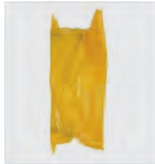
Light Inhibiting Bag - Sterile Bags meet the US Pharmacopoeia performance testing standards for light transmission (nos. 661 and 671). Specifically, light transmission does not exceed 10% at any wavelength in the UV range of 290nm to 450nm