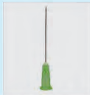
Terumo Needles Sterile Packs Needle material: stainless steel Cap material: polypropylene Hub material: polypropylene Sealing label material: self-adhesive paper (tamper evident closure) Connection type: Luer lock