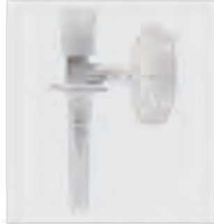
Chemo Dispensing Pins Sterile Pack Materials: Polyethylene / ABS Connection type: Luer lock