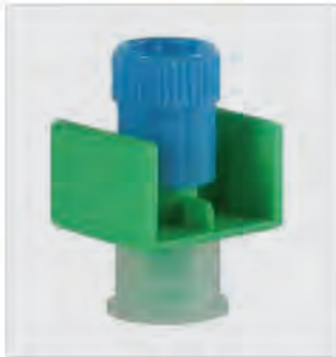
Fluid Dispensing Connector Sterile Pack Connector material: polypropylene Vented cap material: low density polyethylene Connection type: Luer-lock Luer lock cap material: high density polyethylene