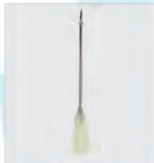
Sterican Needles Sterile Packs Needle material: stainless steel Cap material: polyethylene Hub material: polypropylene Connection type: Luer lock