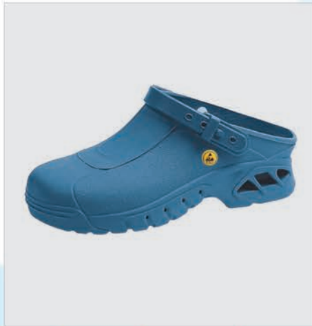
SIZE: 36 - 46 PART NUMBER: 39610