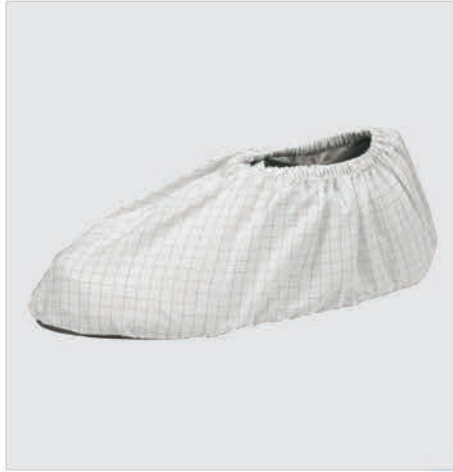
SIZE: 35 - 48 PART NUMBER: 3900