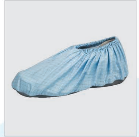
SIZE: 36 - 48 PART NUMBER: 3910