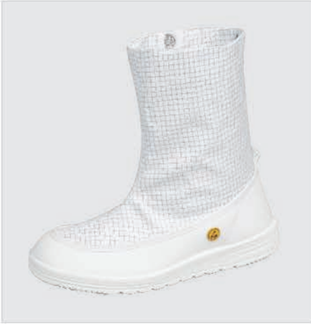
SIZE: 36 - 47 PART NUMBER: 3620