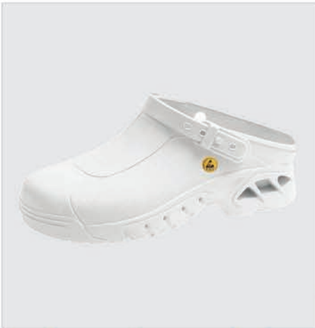
SIZE: 36 - 46 PART NUMBER: 39600