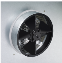
Spigot with damper blade