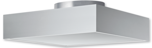
FHD – Construction without centre mullion