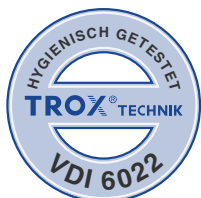
Tested to VDI 6022