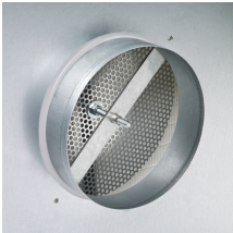
Spigot with adjustable baffle plate