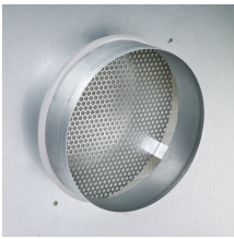
Spigot with fixed baffle plate